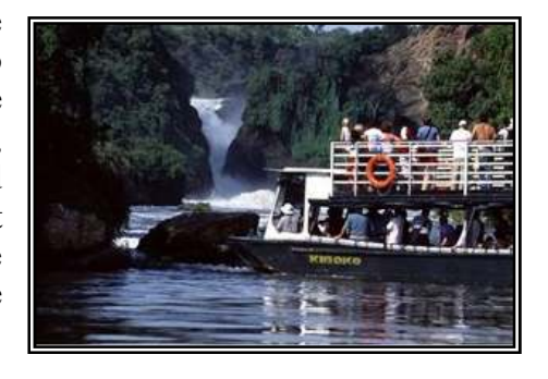
Day 3: Murchison Falls - Kampala

a variety of water bird species, such as the Egyptian goose, Fish eagle, white cormorants etc, the Nile Crocodiles, Hippos, water bucks and Elephants quenching the afternoon thirst. Jump off the boat at the foot of the water fall, you will meet a guide who will guide through the hiking trail up the cliff. On top of the cliff will view the water falls take pictures and return to the lodge for you last night in the Park.